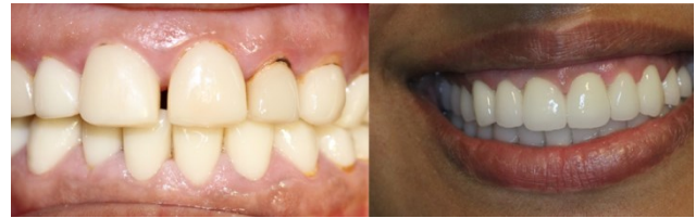
Fig. 5: Crown lengthening before treatment (a). Crown lengthening 6 months after treatment (b).

In the field of aesthetic dentistry there are many procedures where a laser is the treatment method of choice. Crown lengthening or gingival leveling (Figure 5) can be a routine procedure for laser-assisted aesthetic interventions [35]. When Er:YAG is used, almost no anesthesia is needed as it does not cause thermal damage to the tissue. The result is a stable gingival height after the procedure. When required, the bone level may be corrected with an Er:YAG laser equipped with adjustable pulse duration (referred to as VSP technology in Fotona lasers) in a non-invasive way without raising a flap [36].