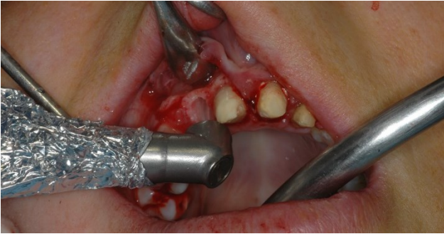
Fig. 4: Cleaning and disinfecting the socket with an Er:YAG laser after extraction.

After the removal of granulation tissues and superficial disinfection [27], the Nd:YAG laser is used for deep disinfection and a biomodulation effect that helps with healing, leading to less edema and pain.