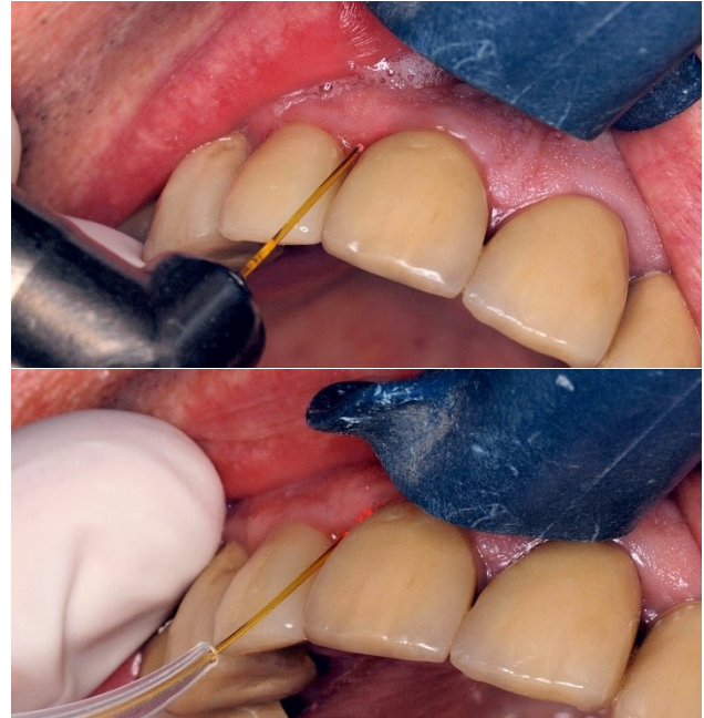
Fig 3: Laser assisted closed perio debridement: initial superficial decontamination and ablation of granulomatous tissue with Er:YAG (a). Deep decontamination and biomodulation with the Nd:YAG laser (b).

Modern periodontal therapy deals with effective removal of infected soft and hard tissue during surgical or non-surgical therapy. There are various benefits of the combined use of laser-assisted and classical methods of periodontal treatments. The Er:YAG laser with an appropriate fiber tip is used for concretum and calculus ablation [10] while removing bacteria [11,12], endotoxins [13] and lipopolysaccharide on the hard root surface, and the elimination of granulomatous tissue on the soft gingival side. The Nd:YAG laser is an indispensable tool to initially decontaminate the pocket [14-17], as well as to deepithelise. Laser-assisted treatment provides successful clinical and microbial results as they are the best solution for decontamination and smear layer removal; eliminating the cause of the periodontal problem and providing a better surface for fibroblast attachment [18]. Both wavelengths help to improve the treatment outcomes [19-23] and patient comfort [21,24-26]. The TwinLight combination of Er:YAG and Nd:YAG laser-assisted, minimally invasive periodontal treatment (Figure 3) is able to replace classical invasive surgery or ease the procedure with increased access, selective removal of tissues and biomodulation during the surgical approach.