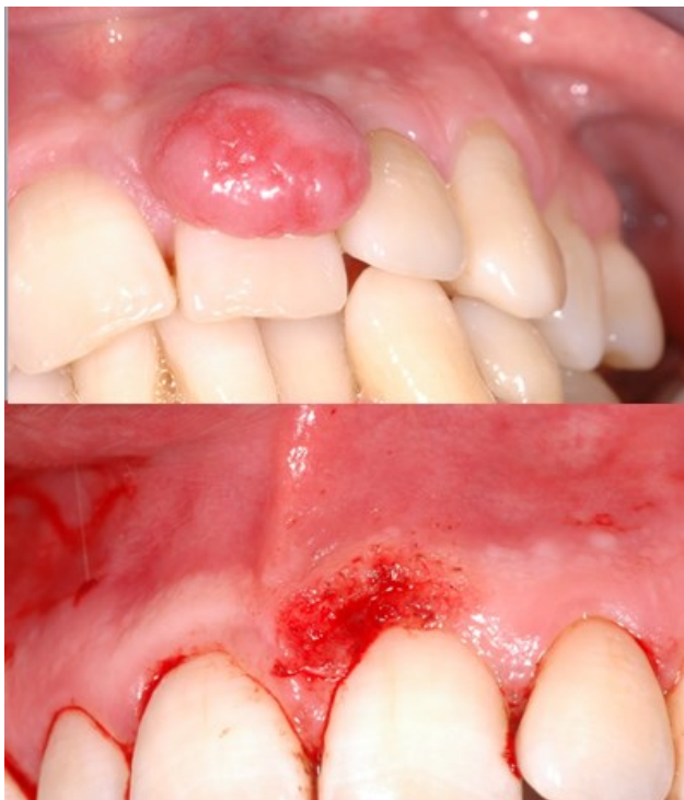
Fig. 10: Before removal of overgrown tissues (a) and immediately after the removal with an erbium laser (b).