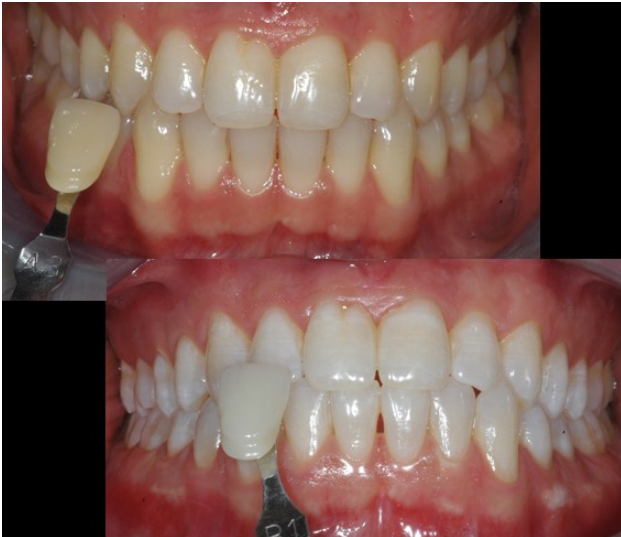
Fig. 8: Before (a) and after (b) TouchWhite™ procedure.

The activation of the bleaching gel (Figure 8) for tooth whitening is very successful with the help of the Er:YAG laser [38,39] with very long pulses. The procedure is patented and known as the TouchWhite™ procedure. The overall treatment time as well as post-operative sensitivity is decreased.